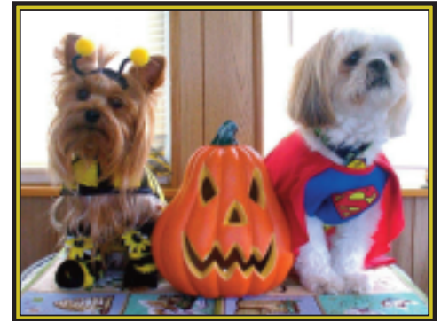
ROCKY & COREY