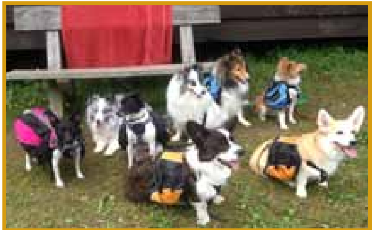
Kit Kat & Jade And all of their Dog Scout Buddies!