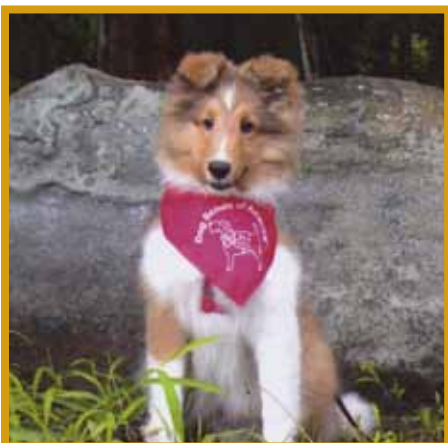
Declan the Dog Scout