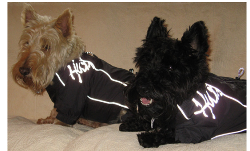
Ian & Aiden