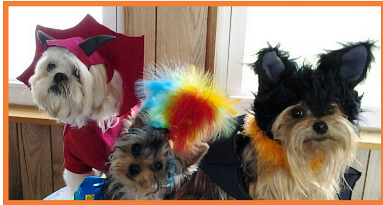
Corey, Lia & Rocky

Err on the side of caution while decorating and choose pet-safe products.